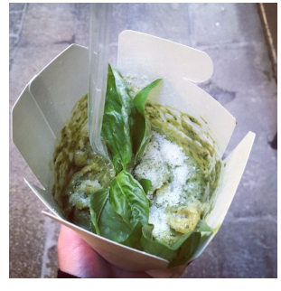
HER GRAND TOUR CHEAP EATS IN VENICE