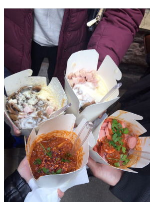
FIDELITY VIAGGI DOVE E COSA MANGIARE A VENEZIA