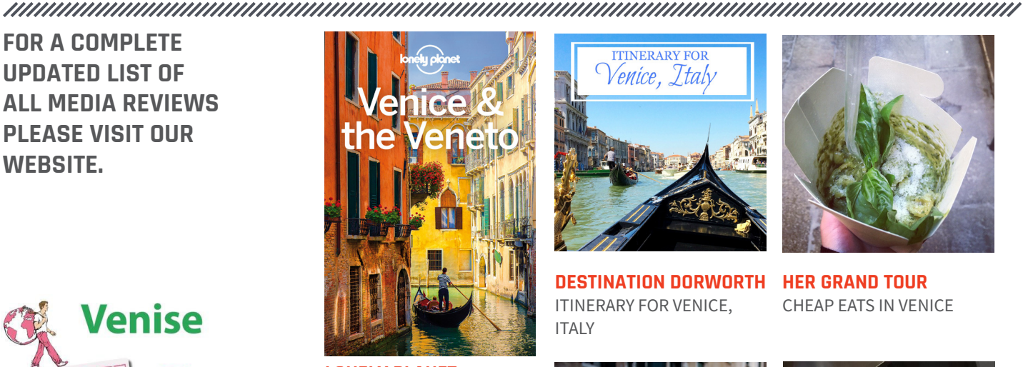
LONELY PLANET VENICE & THE VENETO