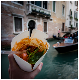
THE CULTURE TRIP WHERE TO EAT THE BEST PASTA IN VENICE, ITALY