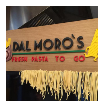
LAVIVA CITYTRIP: LAGUNENSTADT VENEDIG