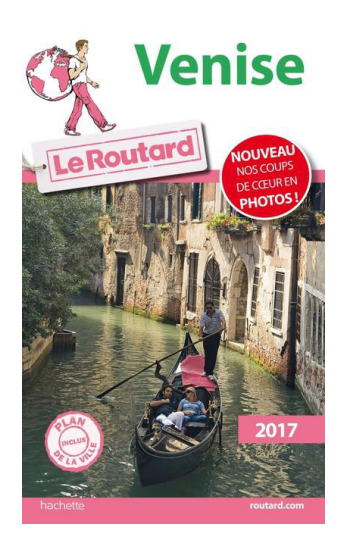
LE ROUTARD VENISE 2017

FOR A COMPLETE UPDATED LIST OF ALL MEDIA REVIEWS PLEASE VISIT OUR WEBSITE.