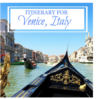
DESTINATION DORWORTH ITINERARY FOR VENICE, ITALY